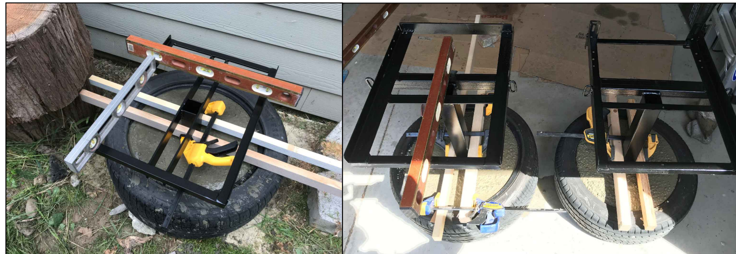
FIGURE D: LEVELING AND SETTING HIVE FRAME IN CONCRETE