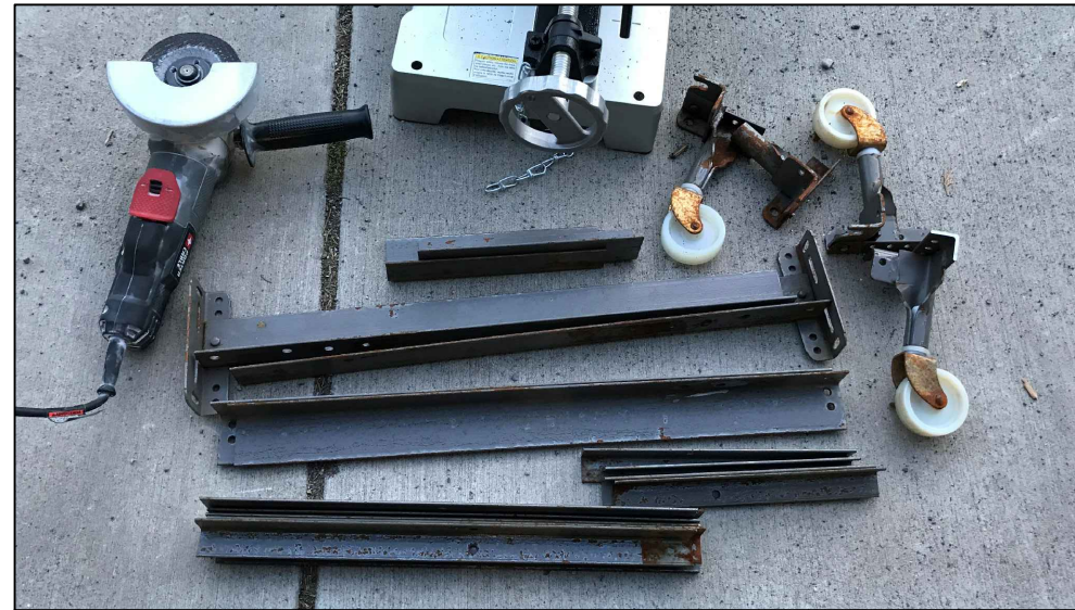
FIGURE A: CUT UP BED FRAME - MAKE 2 HIVE BASES