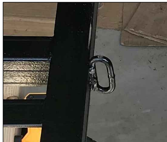
FIGURE C: WELDED LINK DETAIL